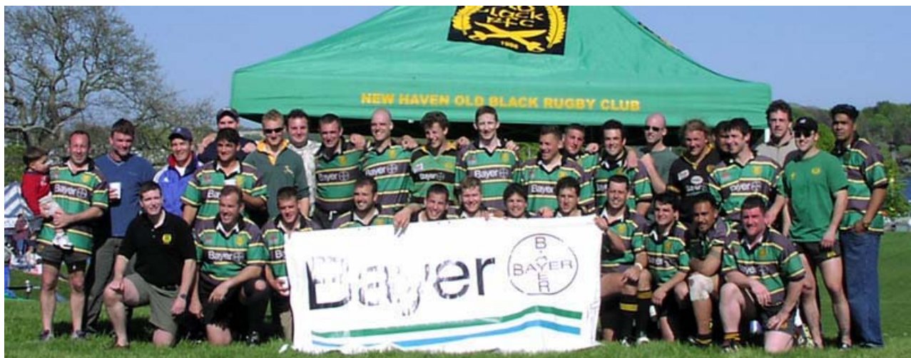
New Haven Rugby in Newport, RI