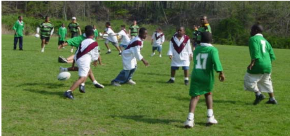
Rugby Camp for Inner City Youth – Summer 2004